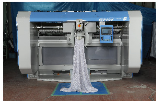
Feed items to conveyor directly

Low position stacker is equipped as standard and blankets are stacked there once folder.