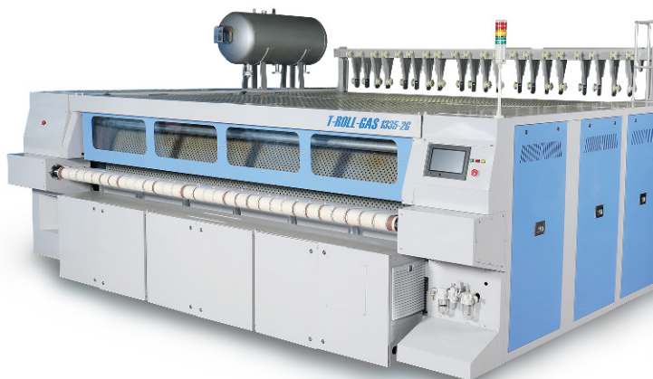
Gas Heated Ironer