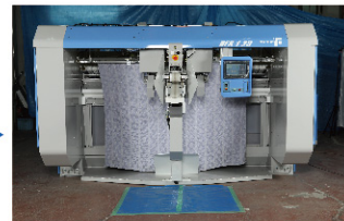
Spread items and transfer