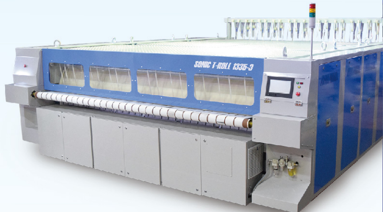
Steam Heated Ironer